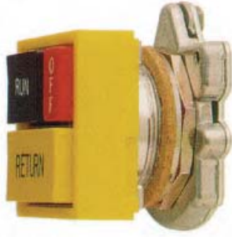
30.5 mm Square Multifunction Watertight/Oiltight—E30