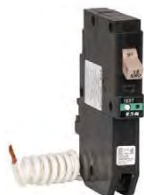
Type CH AFCI Single-Pole Circuit Breaker