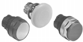
E22/EM22 Pilot Devices

Eaton’s Cutler-Hammer® 22.5 mm industrial heavy-duty pushbutton line offers a wide array of functional, smartly styled illuminated and non-illuminated pushbuttons, selector switches, push-pulls, alternate action and twist-to-release operators. The complete line also includes transformer, full voltage, resistor, LED or neon light units.